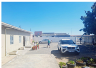
Lingomso Future Center